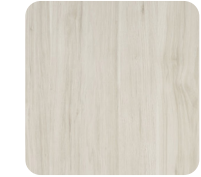
Winter Wood WW