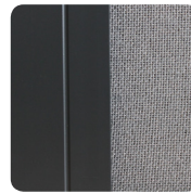
Charcoal Frame & Grey Panels